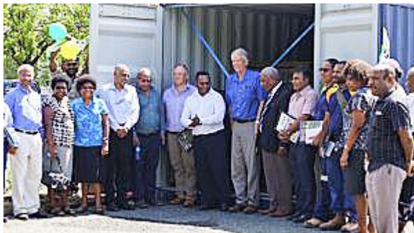
Opening the container at last