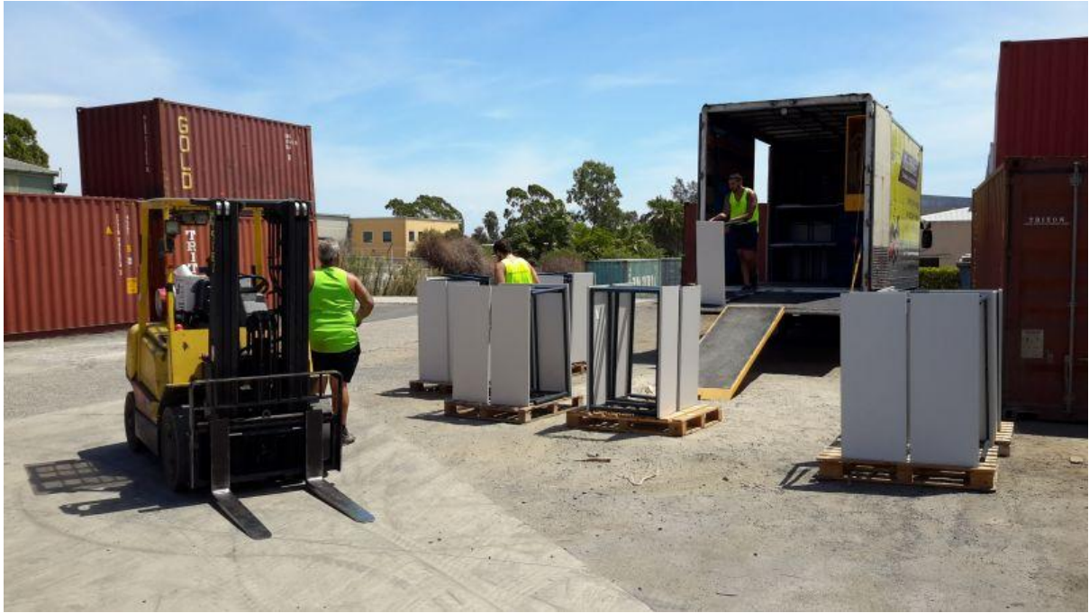
Packing Tables at Depot