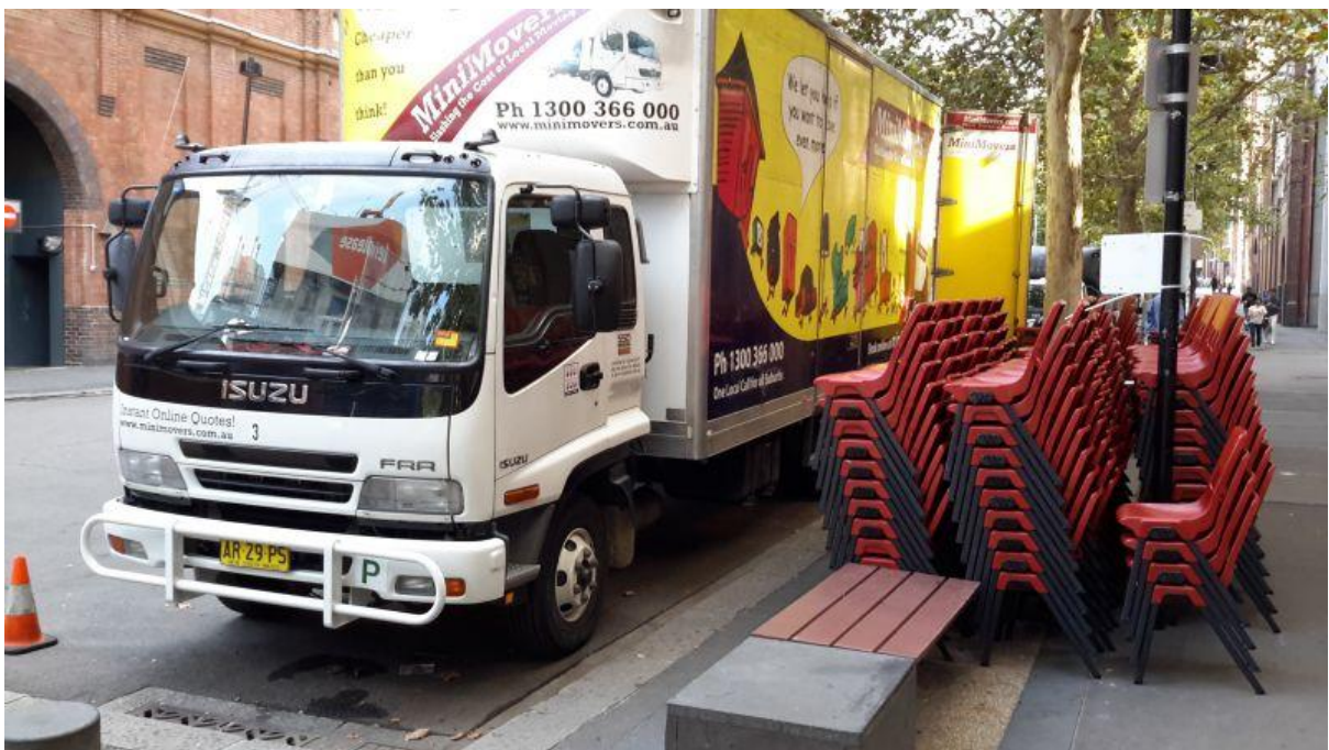
Chairs being stacked