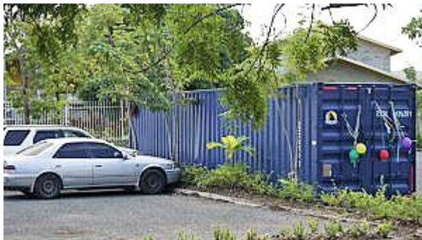
Container Delivered to University