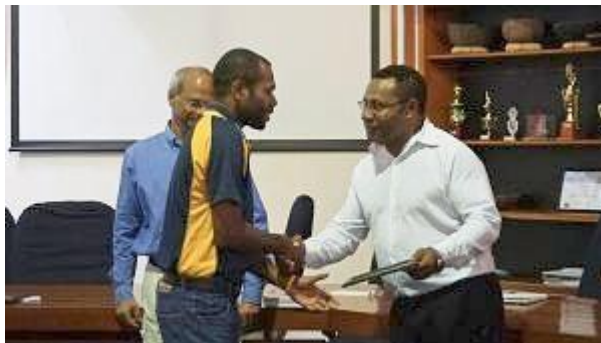
Certificate of Appreciation for East West Transport