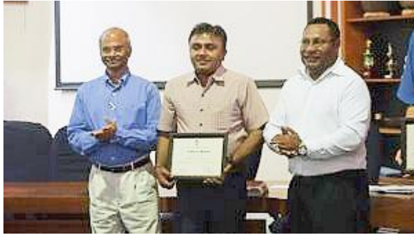
Certificate of Appreciation for POM Rotary