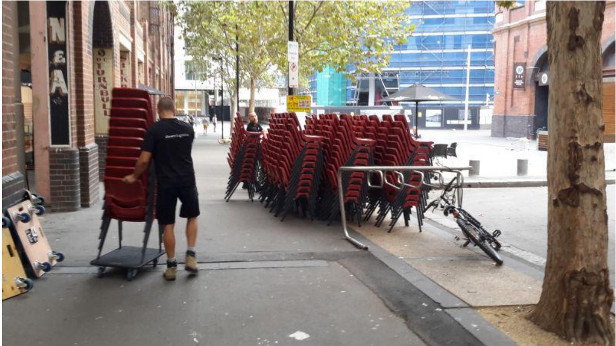
Chairs being moved from site